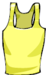
a tank top